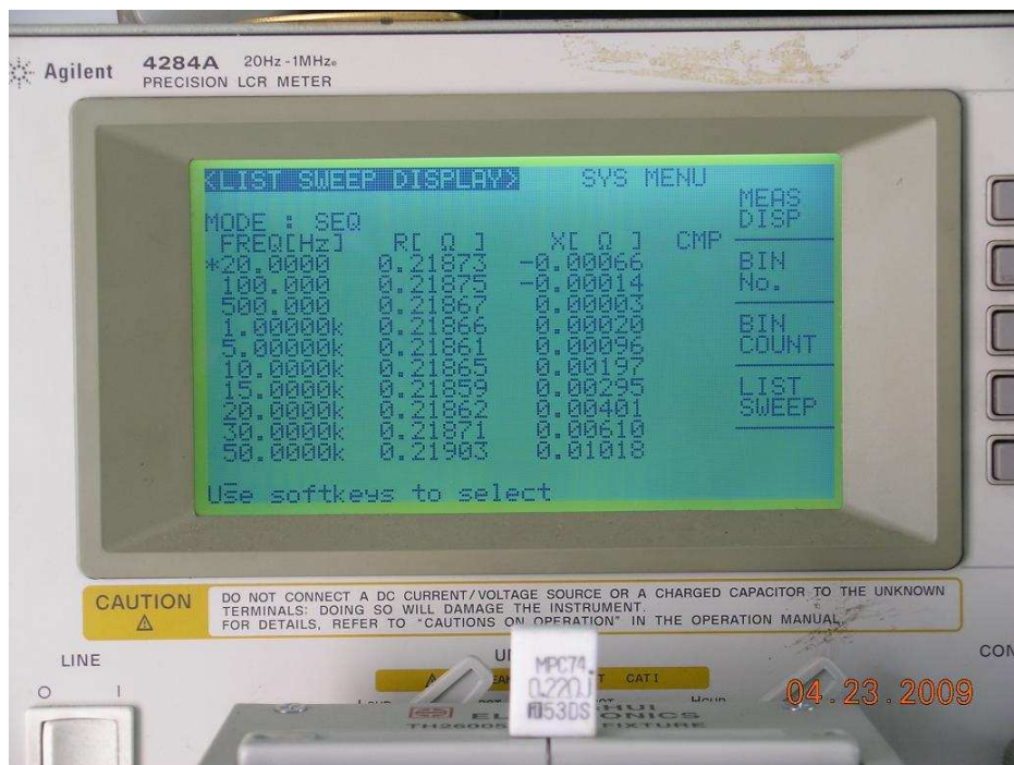
Sweep result for MPC resistor