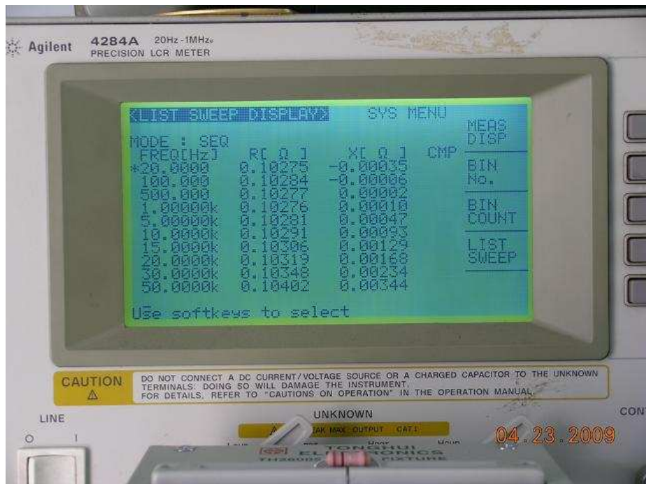
Sweep result for a 2 W carbon film resistor